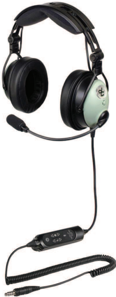
DC ONE-XM Headset